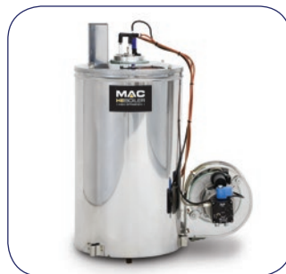
HIGH EFFICIENCY BOILER WITH INCREASED WATER TEMPERATURE AND REDUCED FUEL COSTS & EMISSIONS