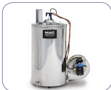
HIGH EFFICEINCY BOILER WITH INCREASED WATER TEMPERATURE AND REDUCED FUEL COSTS & EMISSIONS