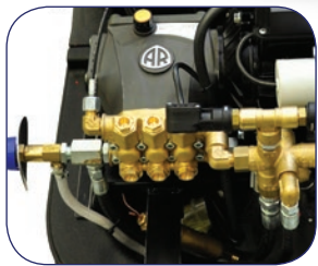
HIGH QUALITY ANNOVI REVERBERI RC 11.17 PUMP