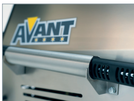
AVANT/ACC002 STAINLESS STEEL LANCE HOLDER Fitted