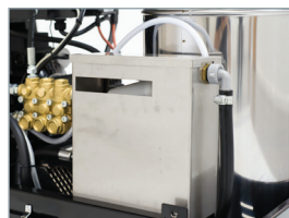
AVANT/ACC005 6LT STAINLESS STEEL BREAK WATER TANK Including float valve, fittings, type AB airgap, fitted to machine