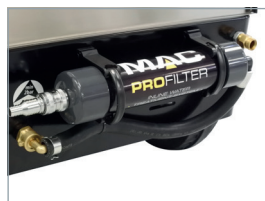
AVANT/ACC010 MAC PRO FILTER – ANTI-SCALE SYSTEM