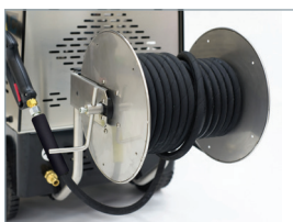
AVANT/ACC001 STAINLESS STEEL HOSE REEL KIT 20mt manual hose reel with mounting kit