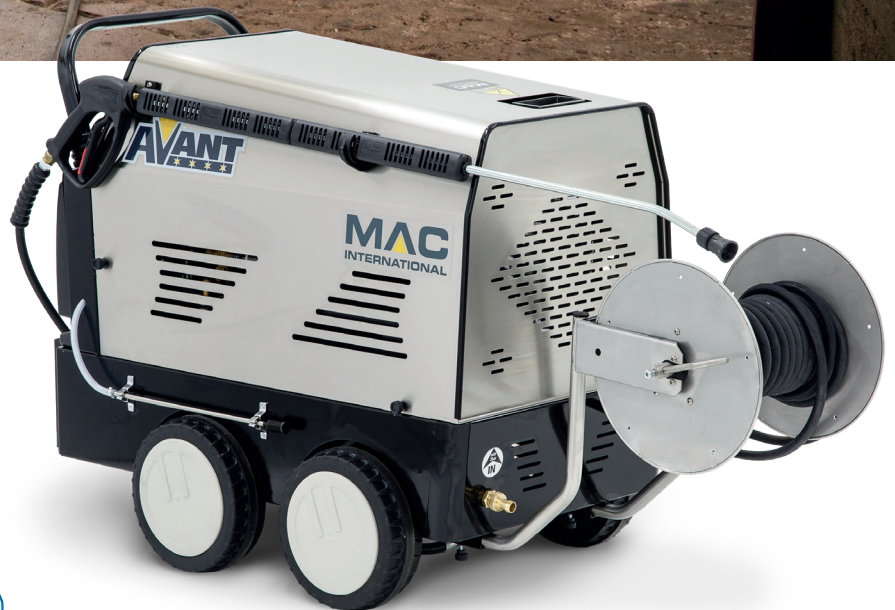
IMAGE SHOWS THE FULLY LOADED MAC AVANT COMPLETE WITH STAINLESS STEEL HOSE REEL AND LANCE HOLDER