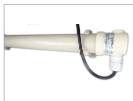
AVANT/ACC004 FROST PROTECTION Including 60 watt heater tube & thermostat