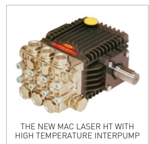
THE NEW MAC LASER HT WITH HIGH TEMPERATURE INTERPUMP