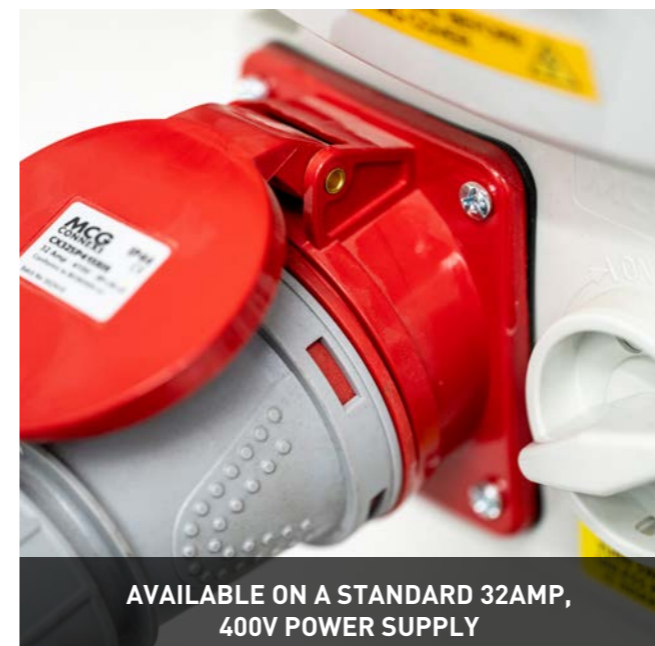
AVAILABLE ON A STANDARD 32AMP, 400V POWER SUPPLY

Zero emissions produced. No fuel required. 100% green and clean hot washing. As the world takes note of climate change, now is the perfect time to consider reducing your fuel emissions through your pressure washer.