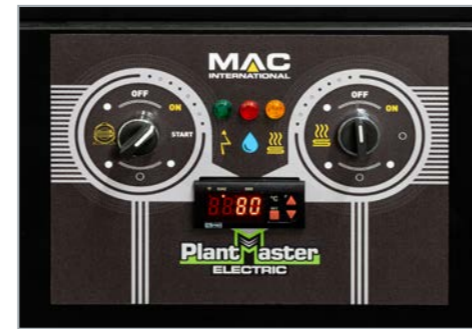
USER FRIENDLY CONTROLS