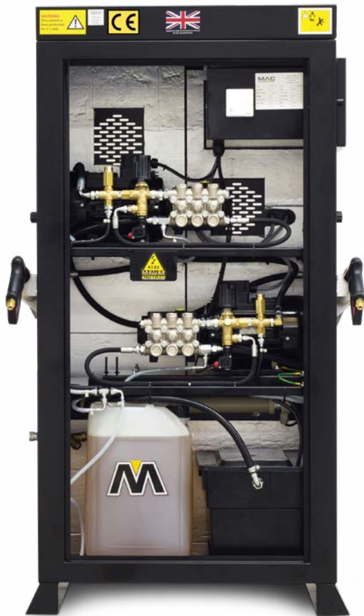
Powder coated version shown above