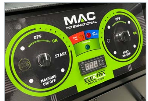
USER FRIENDLY CONTROLS