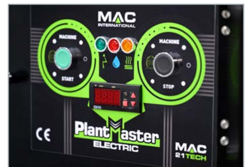
USER FRIENDLY CONTROLS