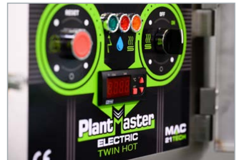
USER FRIENDLY CONTROLS